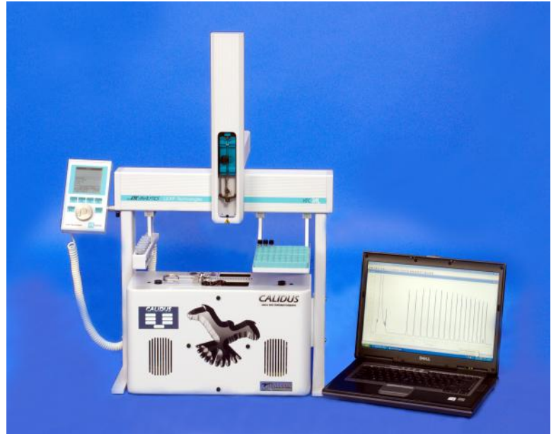
CALIDUS™ microGC with optional autosampler and laptop interface.

FASTER – With analytical cycles 10 to 50 times faster than traditional gas chromatography, the CALIDUS™ microGC vastly increases responsiveness for the data consumer. Less time spent waiting on results means more productivity and timely control of the measured process. In the hands of lab and process managers, the speed of the CALIDUS microGC can translate into better quality products, produced faster and more profitably than ever before.